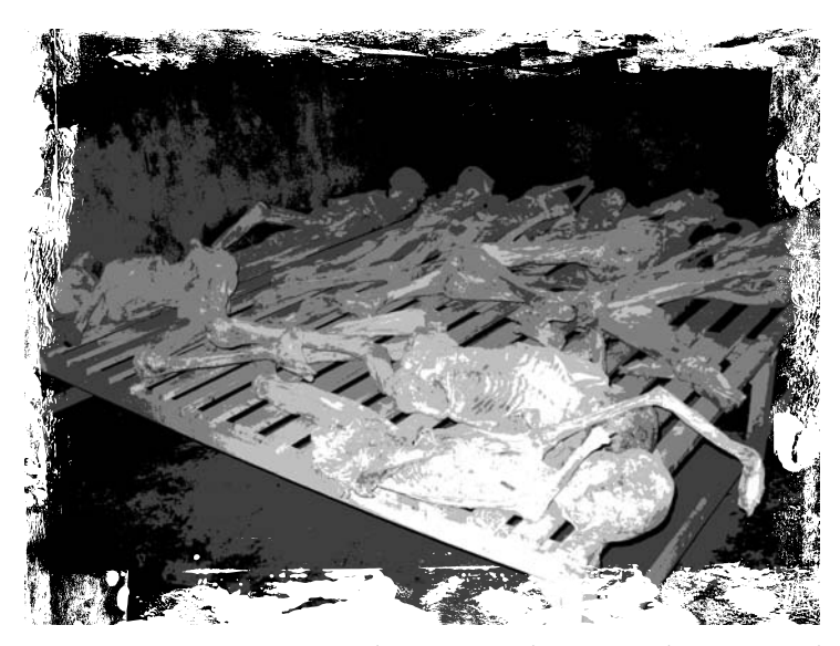
Bodies, Murambi Genocide Memorial