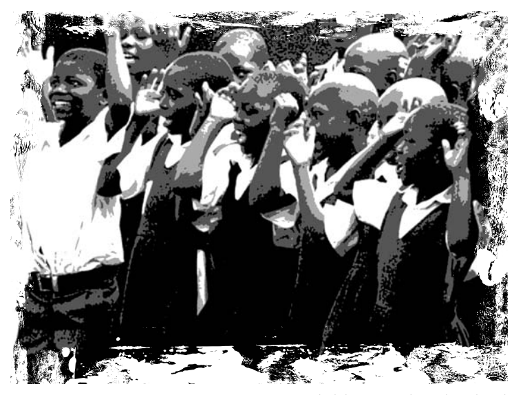
Children at church school