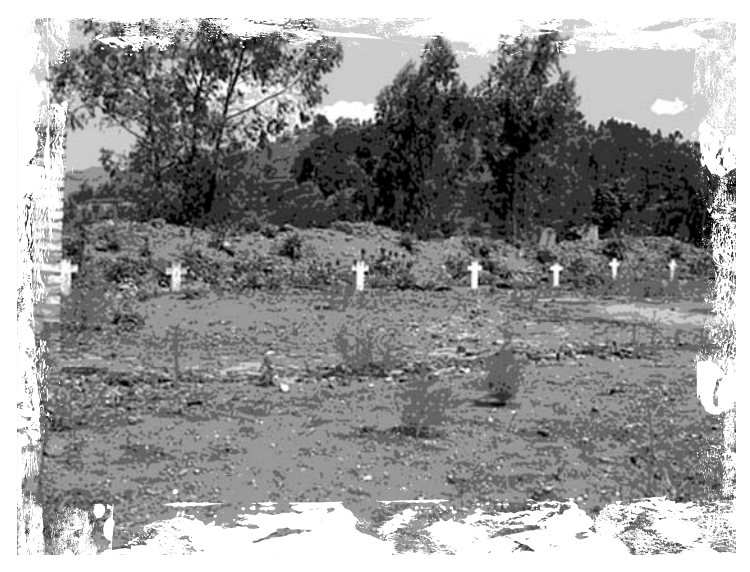
The destroyed church at Nyange