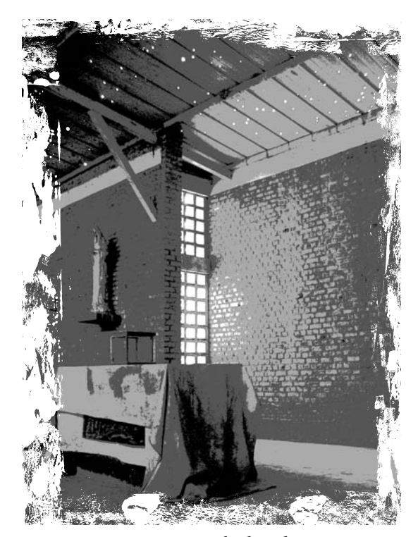
Interior of Church at Nyamata