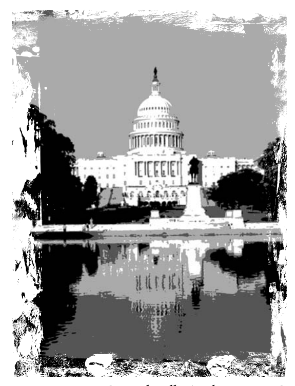
Capitol Hill, Washington, DC