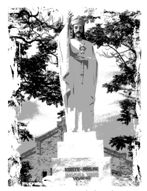
Statue of Christ the King in front of the church at Nyanza