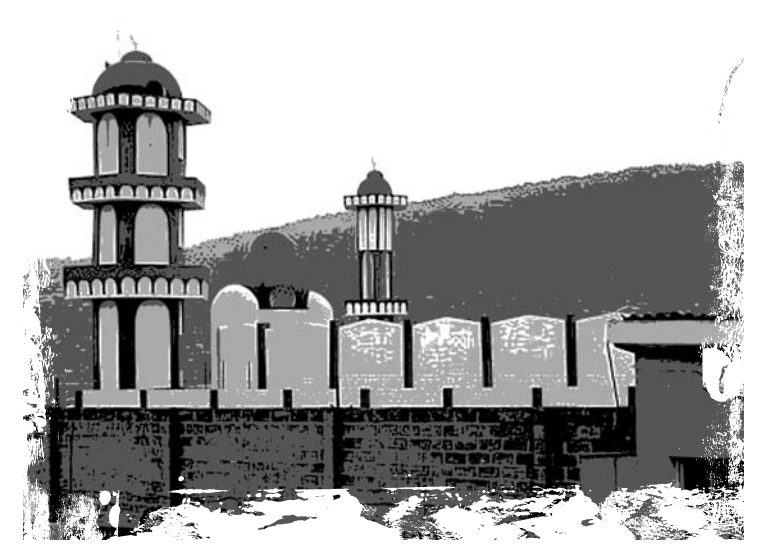
Nyamirambo Mosque, Kigali